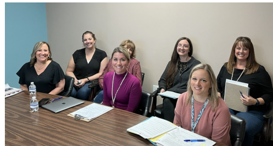
Faculty members who worked diligently on the recertification report hosted the virtual visit to answer questions and affirm the comprehensive STEM program at CA.

On March 19, the COGNIA team conducted virtual interviews and discussions with CA students, staff, and parents to confirm and affirm the data provided. This STEM certification distinguishes Christian Academy as a leader in preparing students for future college courses and careers in STEM-related fields.