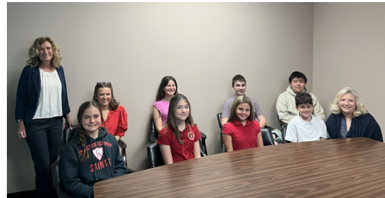
Students fielded questions from the COGNIA team during their virtual recertification visit.

Christian Academy recently hosted a virtual visit from COGNIA as part of the STEM recertification process, highlighting the culmination of hundreds of hours of work by faculty and staff to showcase how STEM is integrated across K-12 learning.